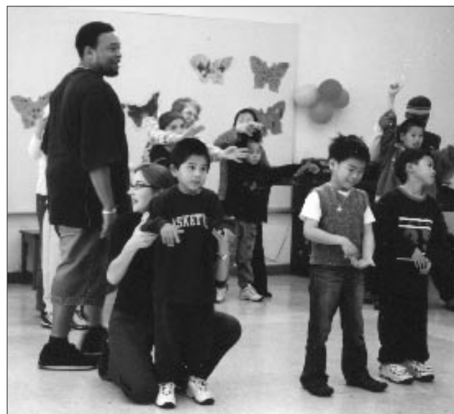
Students in a special education class at Yick Wo Elementary School